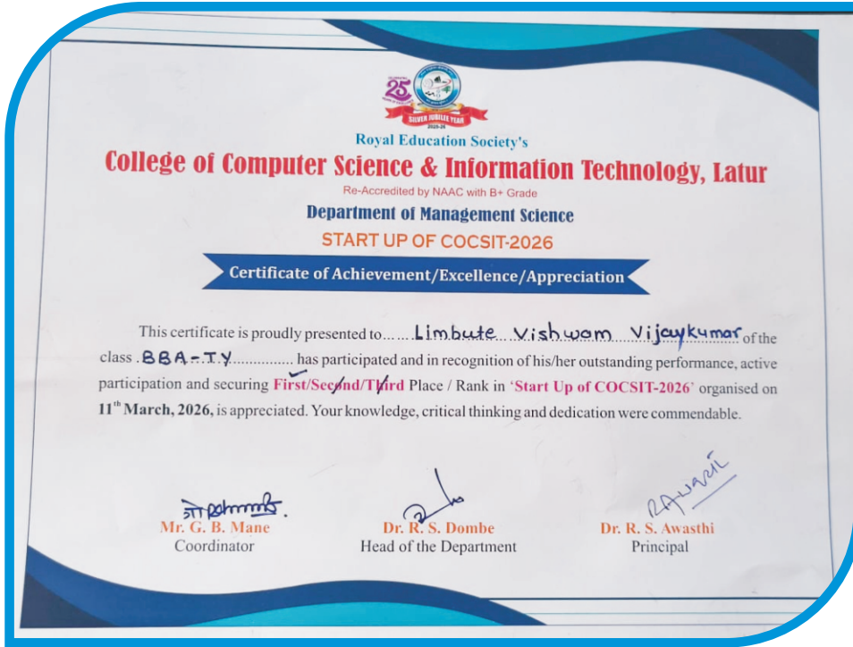
Certificate of Winners & Participant