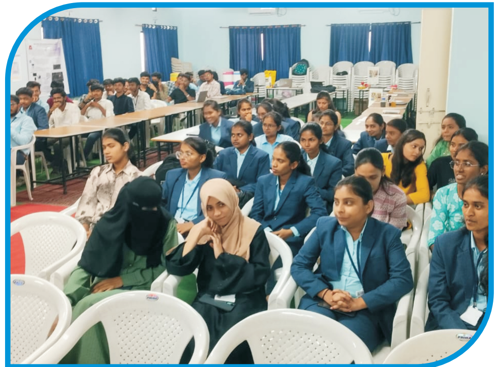
All participants at the time of Inauguration and Valedictory Function